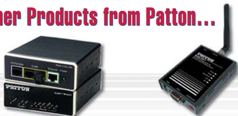
Indoor Ethernet Extenders