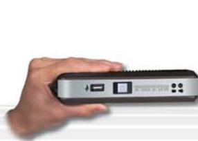
Miniature Industrial Computers